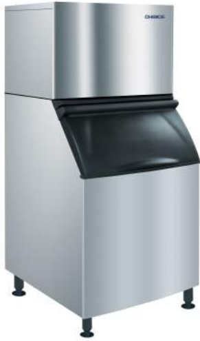
H700 Ice Machine on H530 Bin